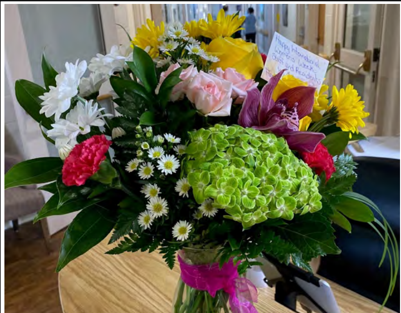
Thank-you Loyalist Flowers for this beautiful bouquet of flowers last month to mark Women's Day.